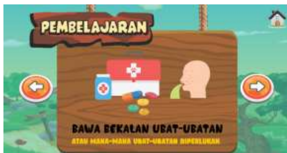
Figure 3. The education module

The education module teaches the schoolchildren on various factors which could lead to flood. This includes incessant logging and clogging of drains and rivers due to rubbish dumping. The courseware also focussed on safety procedures to be taken before, during and after the occurrence of flood. A screenshot of the education module is shown in Figure 3.