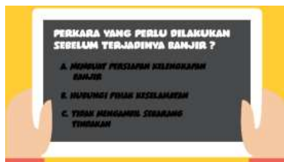
Figure 4(i). Quiz Module Question

The quiz module is intended to gauge how far the schoolchildren have learned about flood disaster and, flood preparedness and safety procedures. To make this a personalised experience, the quiz start by asking the child's name. The child can then answer the quiz, which covers aspects such as factors which cause flood and the safety procedures before, during and after the flood occurs. Feedback is given instantly to the child when the quiz is attempted. The final score of the quiz will be displayed once all questions have been answered. The child can then opt to return to the courseware homepage, or re-attempt the quiz to score a better mark. A screenshot of the quiz module is shown in Figures 4(i) and 4(ii).