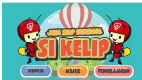
Figure 2. Courseware Figure and Tagline