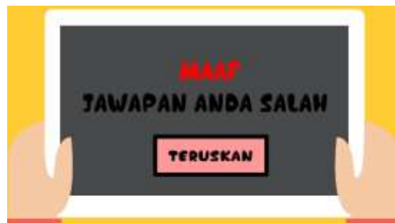
Figure 4(ii). Quiz Module Feedback

In both modules, multimedia elements are used extensively. In the education module, the courseware is incorporated with texts, images, sound and animation that will incite interest in schoolchildren. The narration is simple and easily understood by children. Similarly, the quiz module also incorporates rich multimedia elements that make this learning experience interesting and effective.