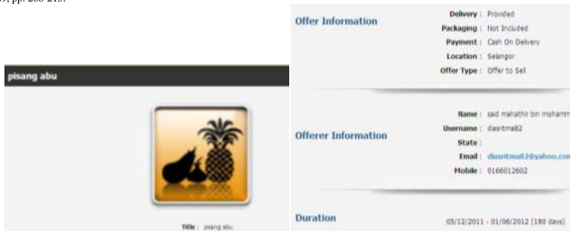
Appendix A: Example of a fullonline product description