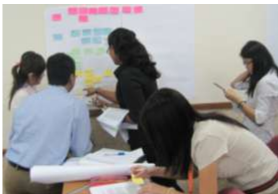
Figure 1. Roadmapping workshop.

This exercise provides an opportunity for the team members to reflect their opinions and thought on the same platform. During the exercise, the top-level managers should seek to clear obstacles. It is expected that various obstacles may appear such as the non-cooperative behavior from team members. It is believed that top-level managers have the influence and power to remove these obstacles. That's why they are invited in the workshop. Figure 1 shows the activities of road mapping in a workshop.