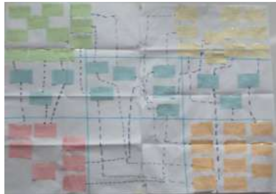
Figure 2. A strategy roadmap.

In this step, data collected from the roadmap is analyzed. The data generated here can turn into two inter-linking analysis that provide mechanisms for spanning the roadmap layers. Arrows were used to shows connections among strategies and business related activities and decisions. Figure 2 shows how the strategies are linked to each other.