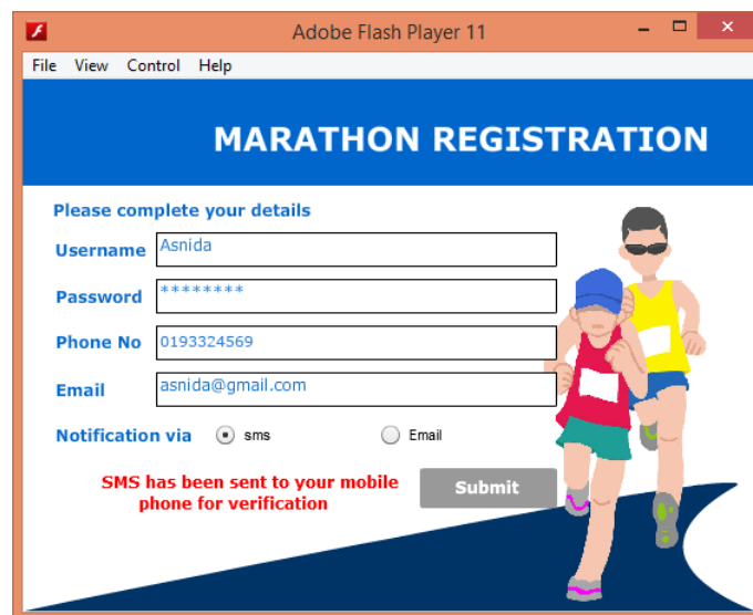
Figure 2: Registration System Development Using Adobe Flash

Based on the model proposed in Figure 1, we have developed a simple registration form for a Virtual Run as shown in Figure 2. The registration is done online. As we wanted to have an interactive system, so we have used flash to develop the form to be responsive meanwhile upon clicking the registration button we have invoked the web service composition workflow as shown in Figure 3. The workflow saves the user data to database and send email or SMS based on user choice. We have developed only the 'store data' web service meanwhile 'send SMS' and 'email' web services was taken from a public repository. We have reduced our development effort and time as we are reusing a web service published for public use.