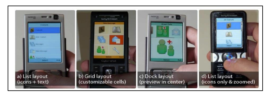
Figure 2. Four Types as Prototype User Interfaces and Layout Generated Using Oldgen Framework (Olwal et al., 2011)

OldGen makes the graphical user interface convenient, so that it can be shifted in between diverse telephone components, irrespective of design and also company. Primary correction and also reviews together with older consumers suggest that principle can deal with personal graphical user interface relevant convenience concerns in general-purpose products. Figure 2 shows the four types as prototype user interfaces and layout generated using OldGen framework.