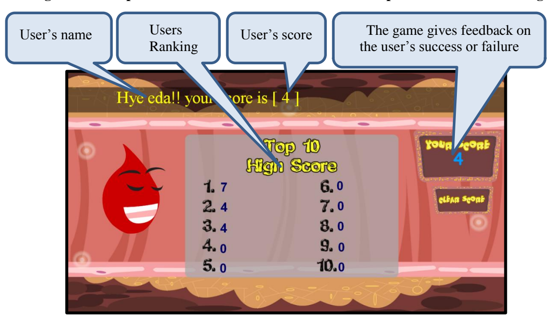
Figure 2. Example of Feedback Elements that was Implemented in Game Design