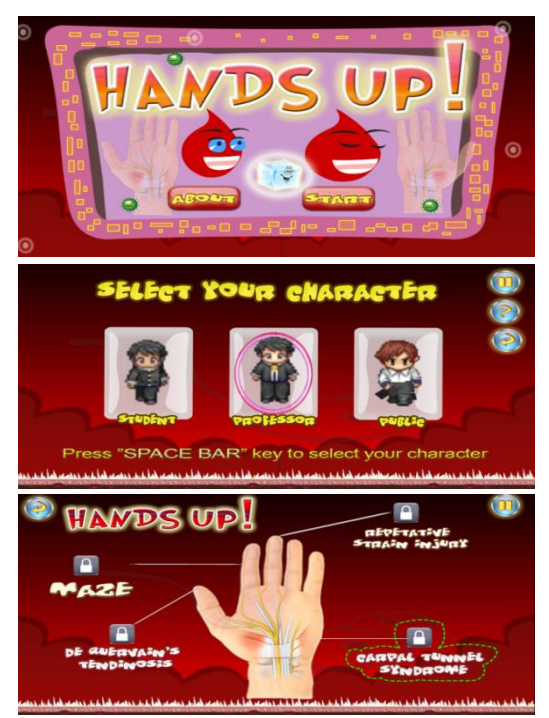
Table 2. Example of Screen Design Before User's Feedback

The design phase provides a comprehensive approach to the design of the game, ensuring the design meets all MIU requirements. This phase was carried out by design a storyboard to get early feedback from actual users. Table 2 shows the description of the screen design before getting feedback from MIU.