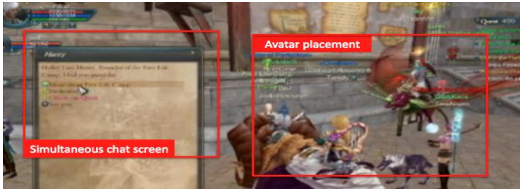
Figure 4. Screen Capture 2

In Figure 5, negotiation to be affiliated is taking place. This reflects the extent of working togetherness. Choices made reflecting virtues such as patience, aggression, etc. The choice made to collaborate with 'real' people avatar instead of artificial agents is also observed. The process of 'getting to know and let's collaborate' is a highlighted experience.