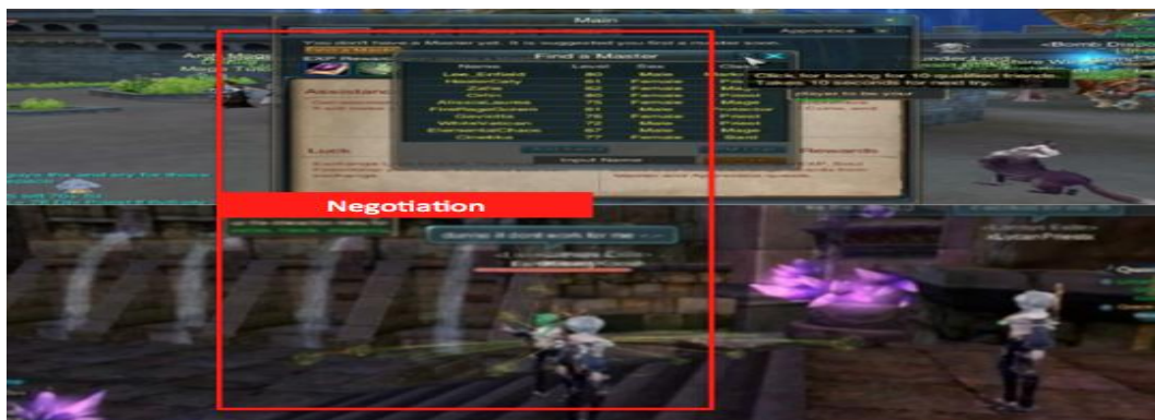
Figure 5. Screen Capture 3

In Figure 5, negotiation to be affiliated is taking place. This reflects the extent of working togetherness. Choices made reflecting virtues such as patience, aggression, etc. The choice made to collaborate with 'real' people avatar instead of artificial agents is also observed. The process of 'getting to know and let's collaborate' is a highlighted experience.