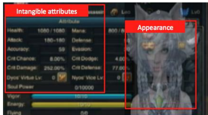
Figure 3. Screen Capture 1

An IVW video montage in Forsaken World™ is made. Reflective observation is conducted by reviewing the video montage in totality. Segments that reflect the experience in collaborating in IVW is identified. Figure 3 shows the level of detailing made in avatar customization. Intangible attributes and appearance were customized. By including these segments of event in the video montage indicates the act of playing with identity is deemed important in the IVW collaboration.